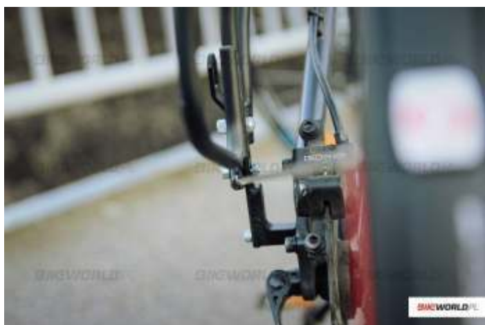
How to assemble the rear mudguard

The mudguards come with a black matt aesthetic finish. In addition, our model was crowned with red at the end, as in splash guards (since it is a variant of the Chameleon range, which offers a considerable wealth of colour) - it is worth mentioning the technology that Simpla praises strongly - the injection of two components, allowing the permanent connection of materials in different colours. It is not possible to speak here of two different elements, because in general the black and the red material form a uniform whole, that first offers a very good look and then it is solid.